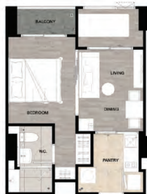
B1-1 | B1-1型 1BED | 1卧 36.70 SQ.M. | 36.70 平米