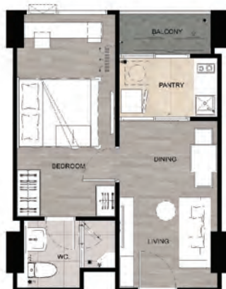
A2-1 | A2-1型 1BED | 1卧 34.17 SQ.M. | 34.17 平米