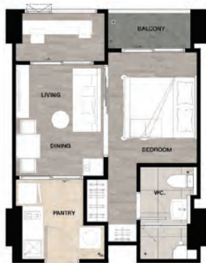
A1-1 | A1-1型 1BED | 1卧 34.37 SQ.M. | 34.37 平米