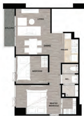
C | C型 2BEDS 1BATH | 2卧1卫 46.22 SQ.M. | 46.22 平米