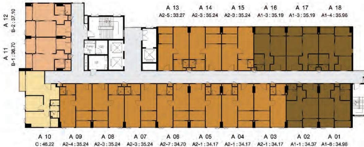
2 nd -12 th BUILDING A A栋 第2-12层